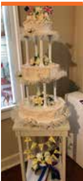
The recent royal wedding made us realize that there are still local residents that have remained loyal to the crown. During our war for independence there were many unions between loyal British subjects and American patriots; in that spirit we wish the best to Meghan and Harry!