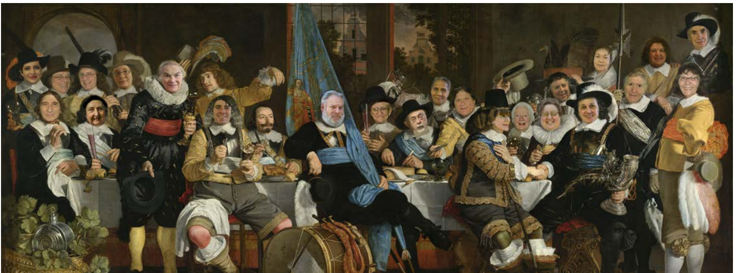
Banquet at the Crossbowmen's Guild in Celebration of the Treaty of Münster , Bartholomeus van der Helst, 1648, Rijksmuseum, Amsterdam

or by appointment. Admission is free; donations accepted