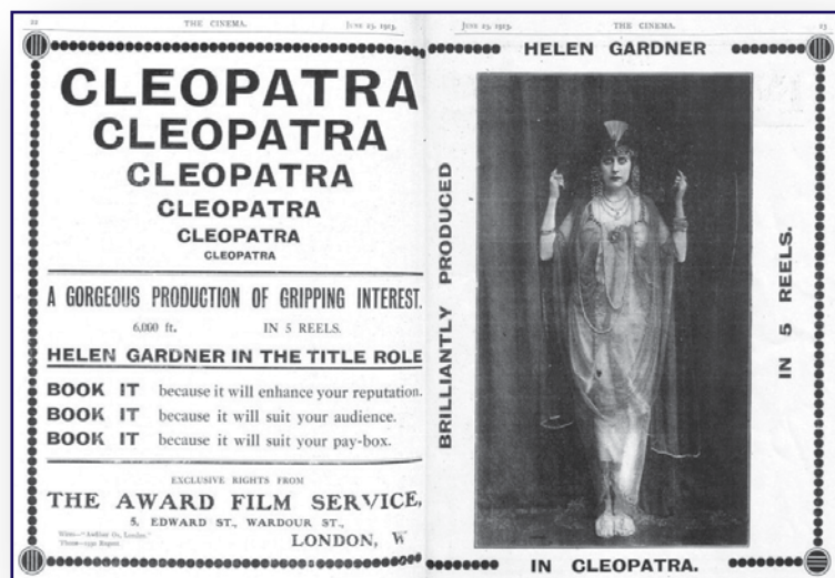
Promotional flyer distributed by the Albany Ward Company in London, England, 1913, promoting Helen Gardner's Cleopatra